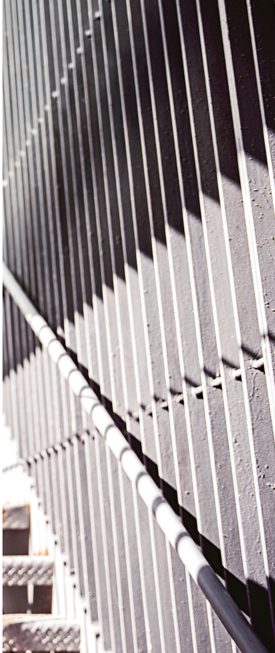
This Concordia student's trauma was compounded by the way the school handled the case

"They put me in a room with the man who assaulted me multiple times, for about two hours each. It was a really bad experience," she says.